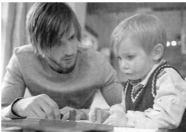
Manny about the house